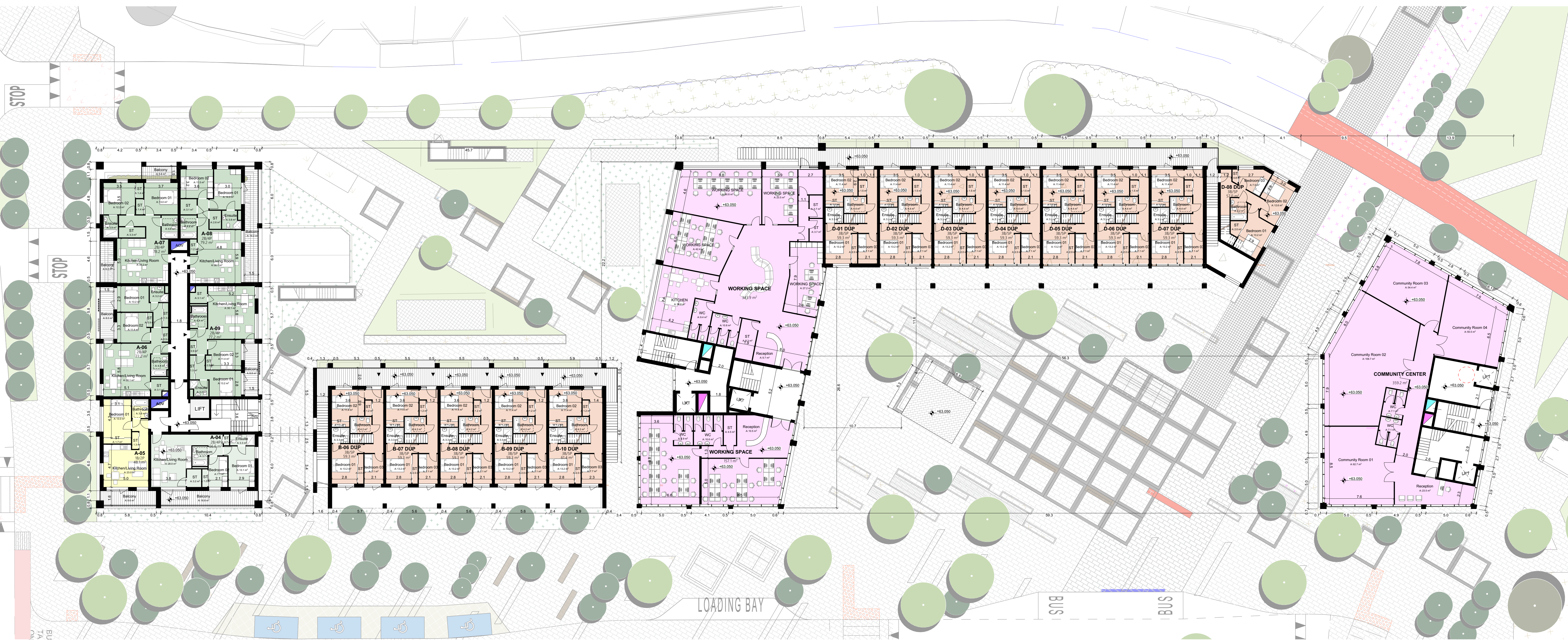
FIRST FLOOR PLAN SCALE 1:200