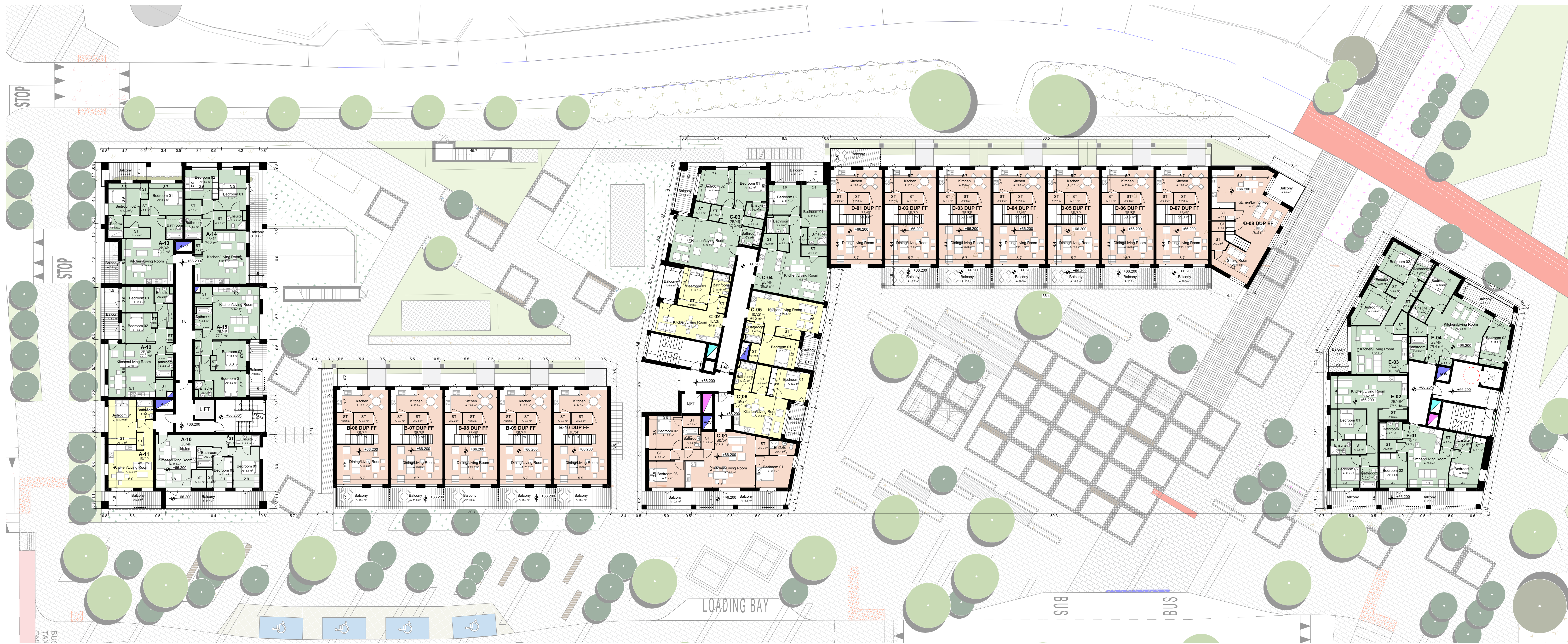
SECOND FLOOR PLAN SCALE 1:200